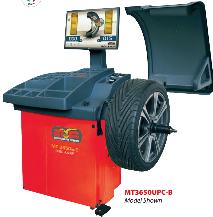
MT3650UPC-B Model Shown

MT3650UPC-C / Same as Above With Collets and Lift