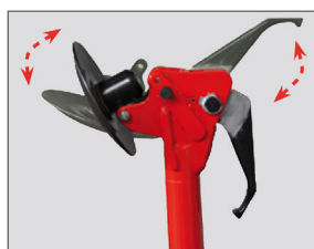
Bead breaker disc with variable tilt with 2 positions.