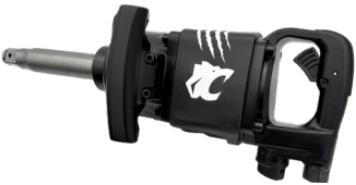
AIR-1992-A Aircat 1" Straight Impact Wrench with 6" Extended Anvil • Provides 1,800 ft-lb maximum torque and 2,000 ft-lb of loosening torque • 5,000 RPM • Low maintenance pin-less hammer provides ultimate reliability and added hitting power • 27.8 lbs