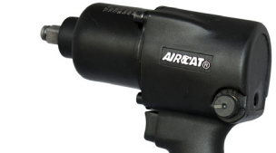
AIR-1431 1/2" IMPACT WRENCH WITH STANDARD ANVIL Provides 800 ft-lb maximum torque and 1,000 ft-lb of loosening torque • 9,000 RPM • Hard hitting twin hammer mechanism • 5.7 lbs