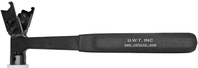
UWT1200HP Wheel Weight Hammer & Remover Tool for removal and application of wheel weights • Replaceable parts • Removes 99% of ALL wheel weights • Eliminates scratched rims