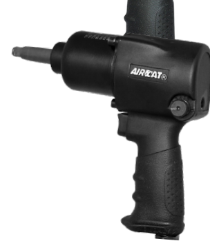
AIR-1431-2 1/2" IMPACT WRENCH WITH 2" EXTENDED ANVIL Provides 800 ft-lb maximum torque and 1,000 ft-lb of loosening torque • 9,000 RPM • Hard hitting twin hammer mechanism • Includes Grey Pneumatic® Thin Wall Flip Socket (19 mm / 21 mm) • 6 lbs