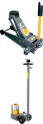
GT-G420303 Winntec 3 Ton Turbo Floor Garage Jack • Built with quality materials and loaded with features • Professional universal joint release • Handle protector • Min. height 5.12" • Max. height 19.29" • Length 31.30" • Width 15.16" • Gross weight 94.7 lbs

EMZ45220 Aerosol can • Specifically developed to safely clean the mass air flow sensor • 100% Heptane Formulation • VOC Complaint • Periodic use of Mass Air Flow Sensor Cleaner will keep the engine running at peak efficiency, increase horsepower, improve air/fuel ratio, and help to restore fuel economy • Dissolves dirt and grease • Will not harm sensitive electronics or plastics • Fast-drying formula • 390 g